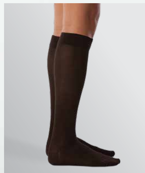
20-30mmHg Closed Toe Calf Small Long in Brown 222CSLW11