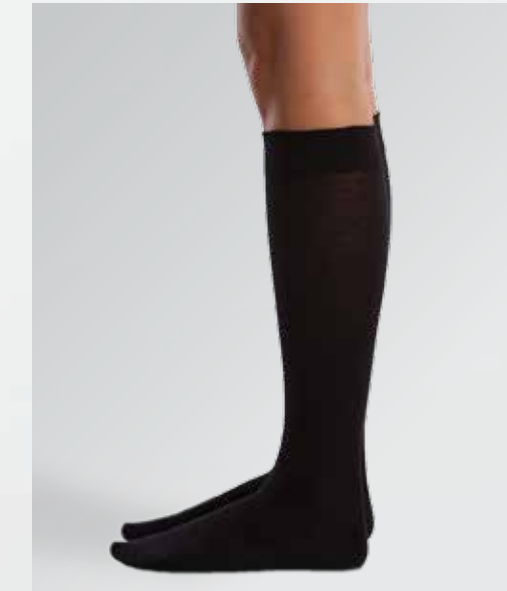
20–30mmHg Closed Toe Calf Small Long in Navy 242CSLW10