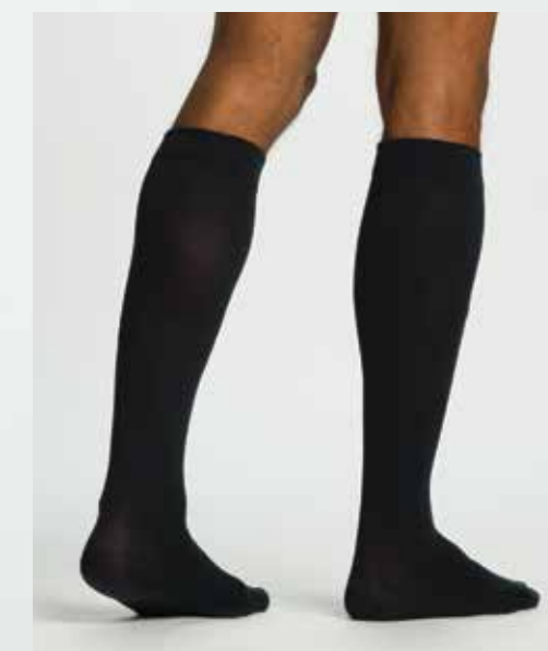
20-30mmHg Closed Toe Calf Medium Long in Navy 222CMLM10