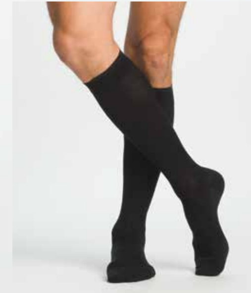
20–30mmHg Closed Toe Calf Medium Long in Black 242CMLM99