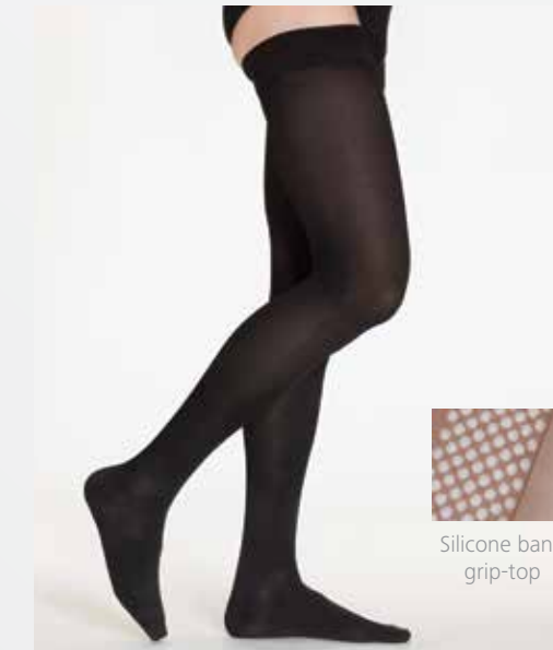
20–30mmHg Closed Toe Thigh-high Medium Long in Black 232NMLM99