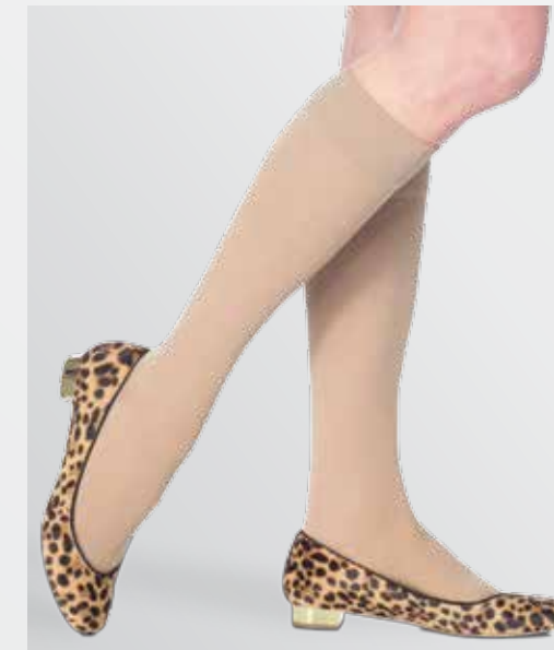
20–30mmHg Closed Toe Calf w/Grip-top Medium Long in Crispa 232CMLW66/S