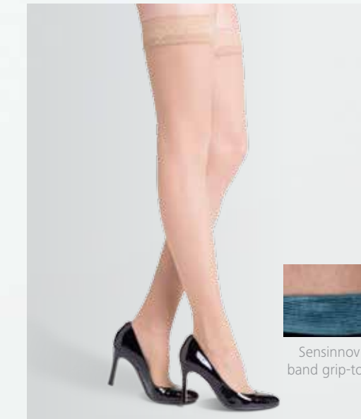
20–30mmHg Closed Toe Thigh-high Medium Long in Suntan 782NMLW36