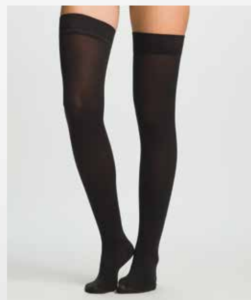
30-40mmHg Closed Toe Thigh-high Medium Long in Black 863NMLW99