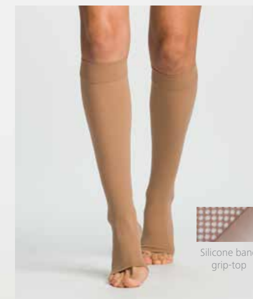
20-30mmHg Open Toe Calf with Grip-top Small Short in Crispa 862CSS066/S