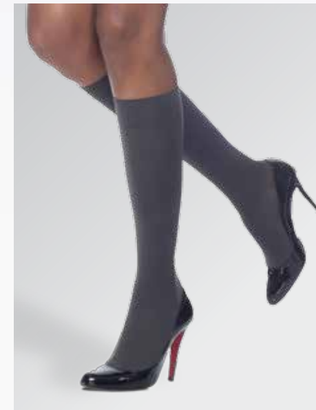
20-30mmHg Closed Toe Calf Medium Long in Graphite 842CMLW91