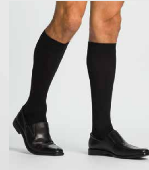
15–20mmHg Closed Toe Calf Size C in Black 186CC99