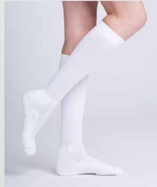
15–20mmHg Closed Toe Calf Size B in White 142CB00