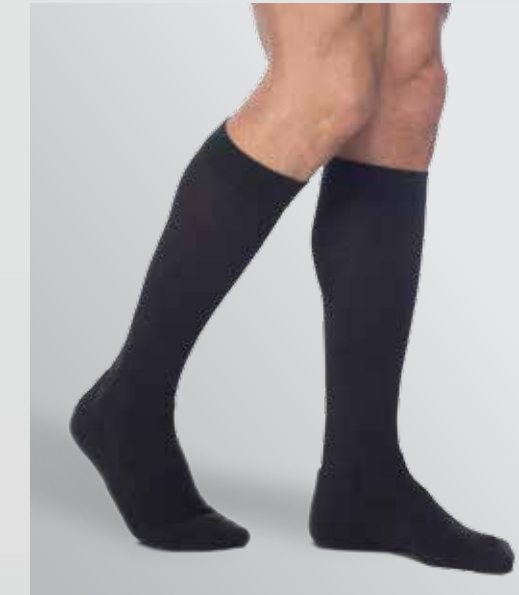
15–20mmHg Closed Toe Calf Size C in Black 182CC99