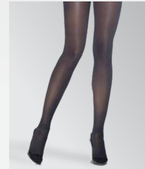
15–20mmHg Closed Toe Pantyhose Size C in Black 120PC99