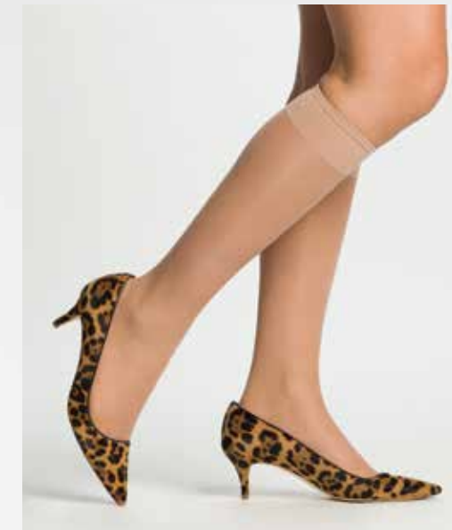
15–20mmHg Closed Toe Calf Size B in Natural 120CB33