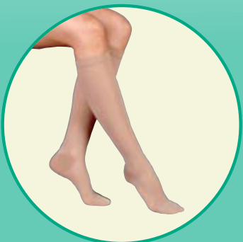
Available knee-high, thigh-high and pantyhose