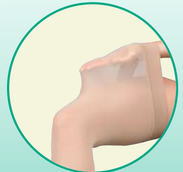
Two-way stretch elasticity