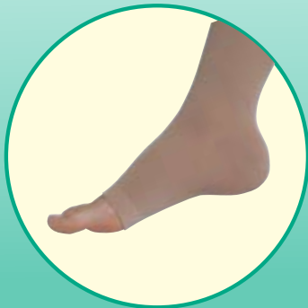
Available in open or closed toe