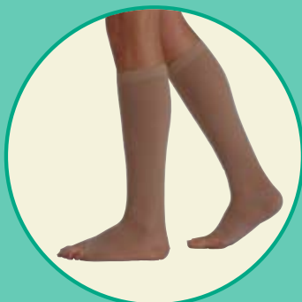
Wide assortment of sizes and styles