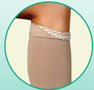
Silicone border available on knee and thigh-highs