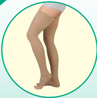
Versatile, durable stockings